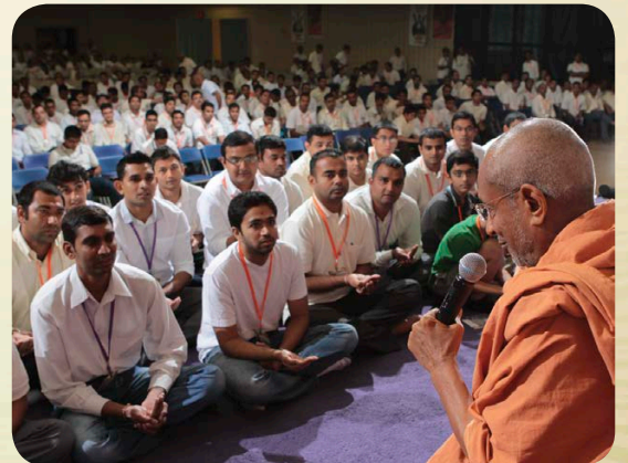
Youths receiving Swamiji’s divine blessings

Lasting Thought “Despite any amount of one’s own efforts, disturbing thoughts/habits are impossible to overcome. But if a Gunatit Sadhu casts just a single glance, all disturbing natures are instantly eradicated. Therefore, take refuge in a Gunatit Sadhu.” ~ (Swami ni Vaato 5-267)